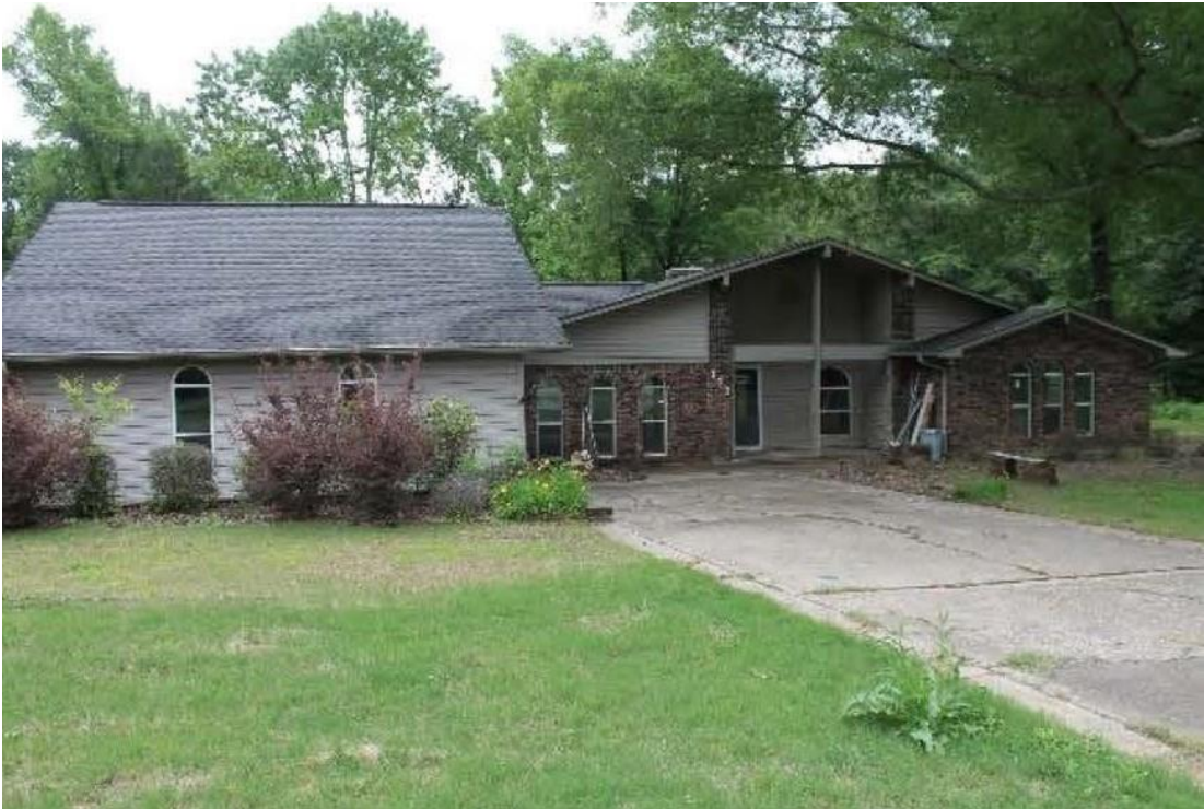
122 Stanford Rd, Conway, AR