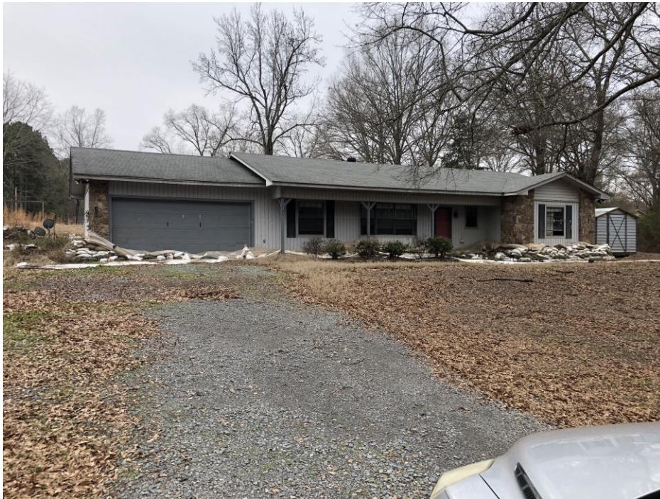
105 James Road, Conway, AR

Photos of each property to be demolished attached below: