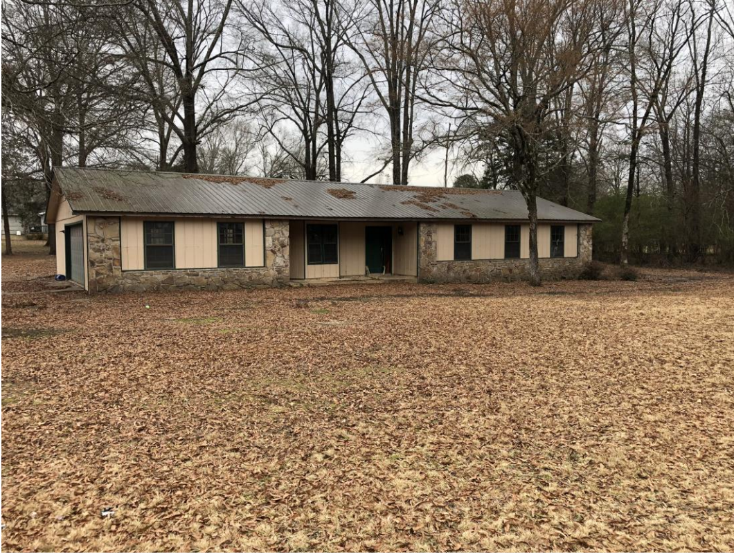
115 James Rd, Conway, AR