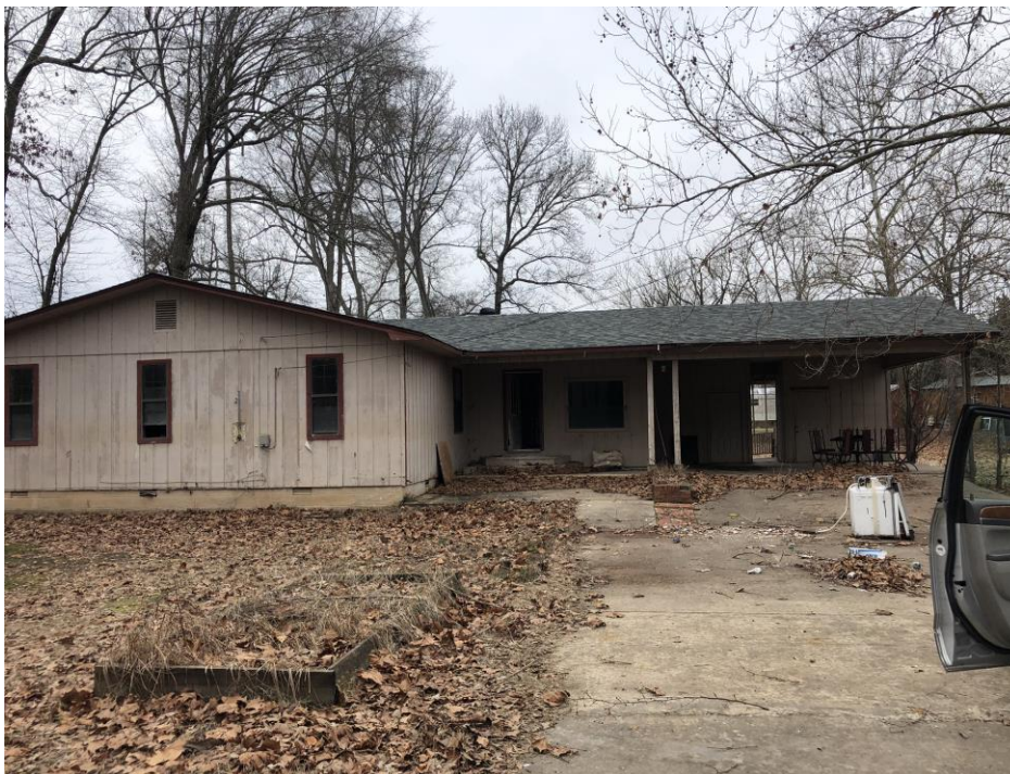
195 Hwy. 89 N., Mayflower, AR