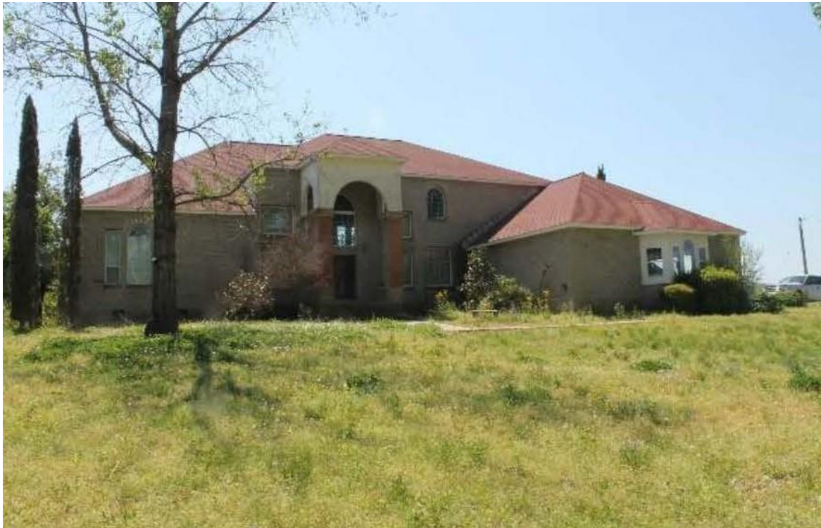
127 Jones Lane, Conway, AR (Photo 2/2)