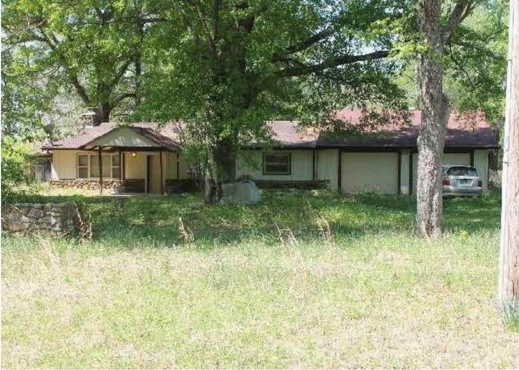
#4 Caney, Conway, AR