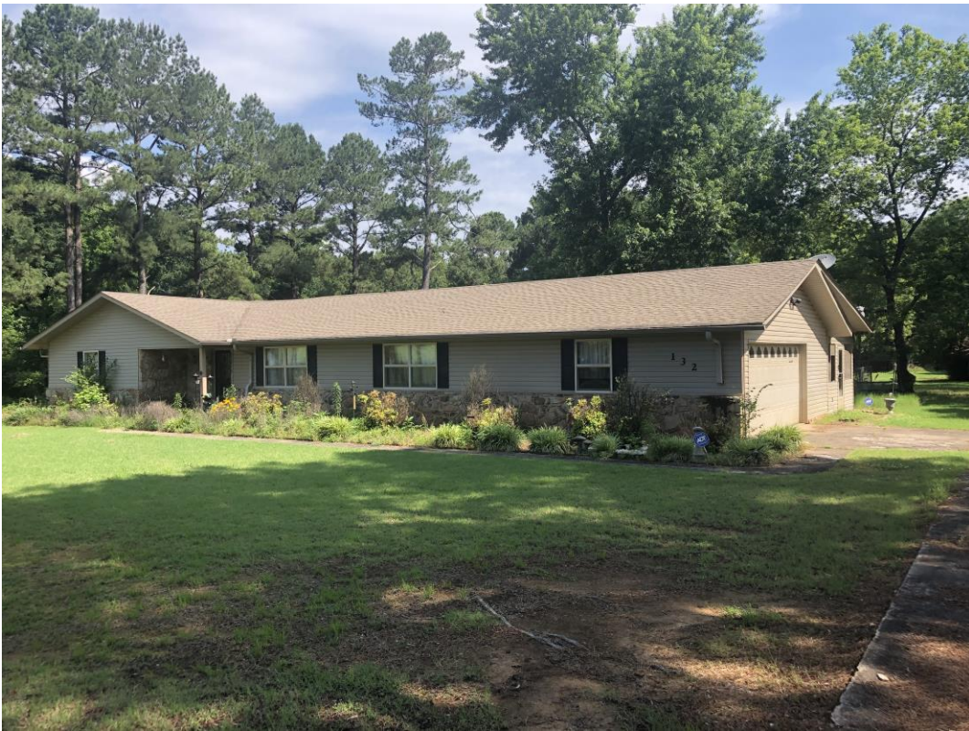
132 Stanford Rd, Conway, AR