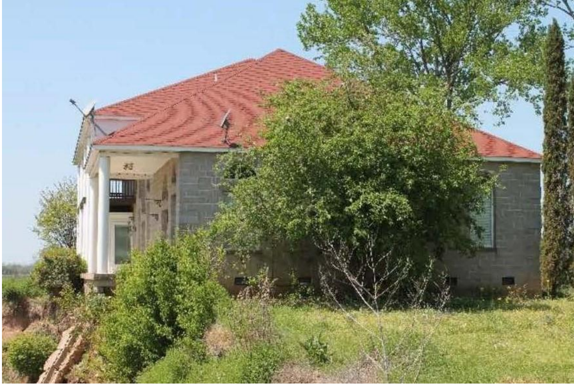
127 Jones Lane, Conway, AR (Photo 1/2)